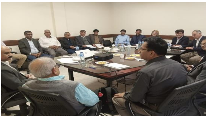
Conference in Progress

In March, 2023 a two-day conference was held in Islamabad. The coordinators of Northern, Central and Southern regions of Pakistan attended the conference. The purpose of the conference was to align the activities and programs of all the regions in accordance with the mission of FBLP. Regional directors shared their activities and challenges. Chairman FBLP shared his views on the areas where more efforts are required for meeting the targets of poverty alleviation. The conference was also attended by President of Regional Council Central.