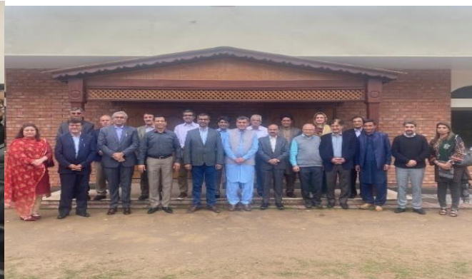
Group picture of Conference Participants